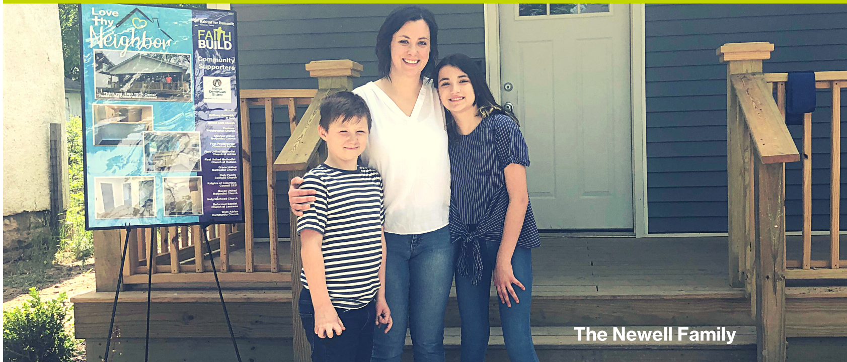
The Newell Family